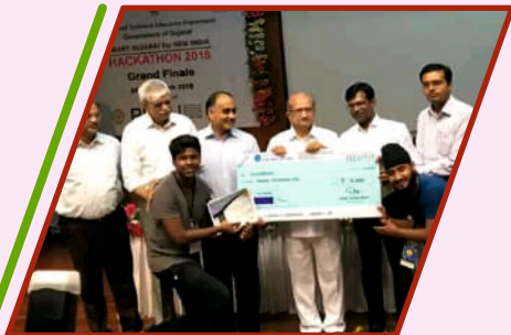
1st Prize in Gujarat Hackathon in 2018