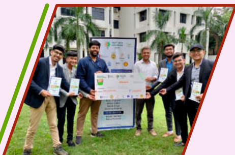
Won 1st Prize in Smart India Hackathon 2022 among all UG & PG Teams