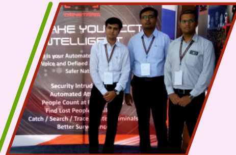
2nd Prize in Gujarat Hackathon in 2018