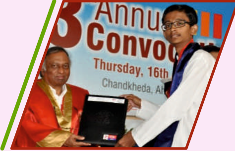
Gold Medal of Student in Gujarat Technological University