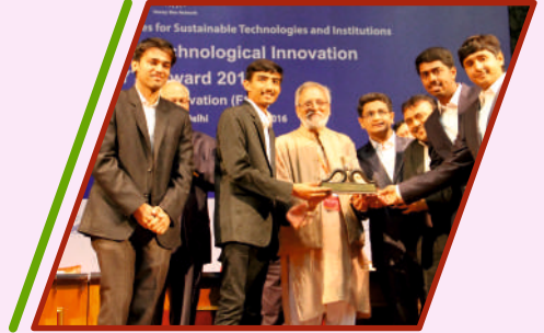
Gandhian Young Technological Innovation (GYTI) Award 2016