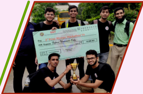
2nd Prize in GTU Hackathon 2019