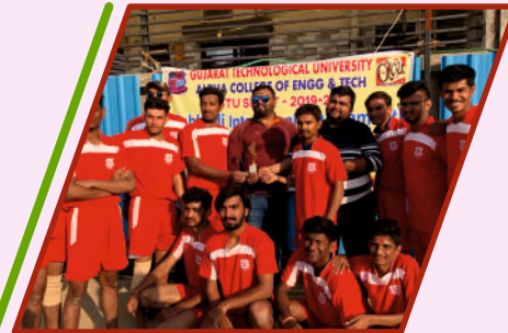
Winner GTU Inter- Zonal Kabaddi Tournament 2020