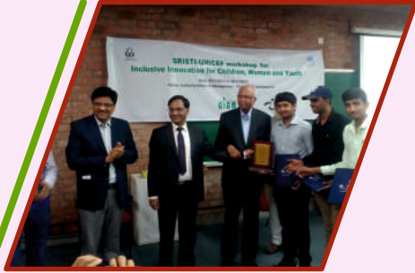
SRISHTI UNICEF 2015