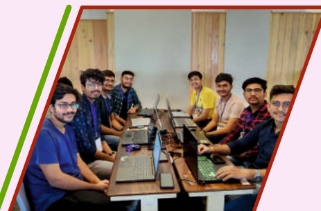
Won 2nd Prize in SSIP Gujarat Hackathon 2023