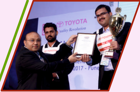
1 st Prize in Toyota 9 th National Seminar in SA T-TEP Category