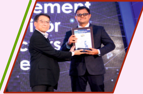
2 nd Prize in Toyota 10 th National Seminar in SA T-TEP Category