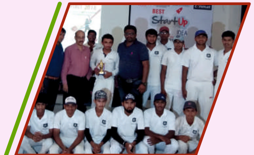
Winner GTU Inter- College Cricket 2018 Ahmedabad Zone