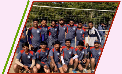
Winner GTU Inter- Zonal Volleyball Tournament 2020