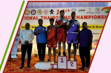
Gold Medal at National Thai Boxing Championship