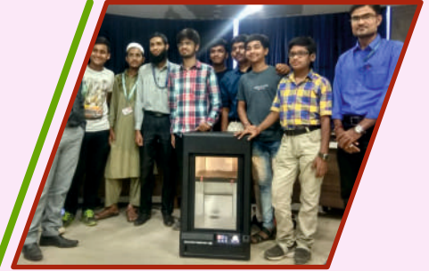
CIC3 Awards for Faculties & Students