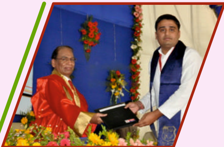
Gold Medal of Faculty in Gujarat Technological University