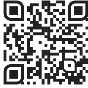
National Scholarship For Minority