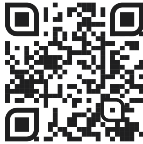
LIC GoldenJubilee Scholarship