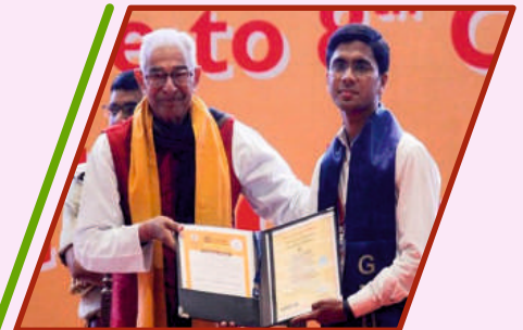
Gold Medal of Student in Gujarat Technological University