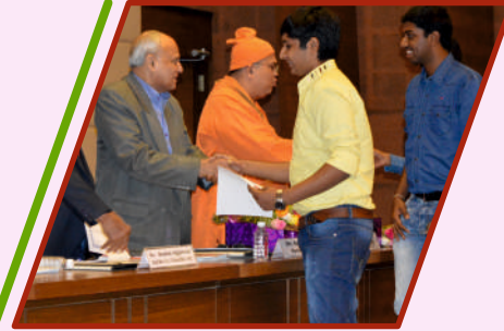
GTU Innovation Award 2015