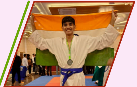
Bronze Medal at Indo- Nepal International Karate Championship