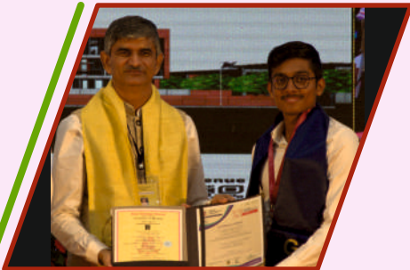
Gold Medal of Student in Gujarat Technological University