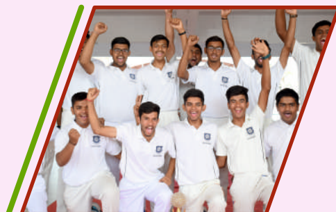
Winner GTU Inter- College Cricket 2022 Ahmedabad Zone